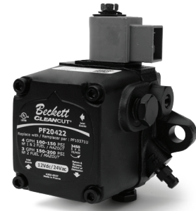
CleanCut XL PF20422