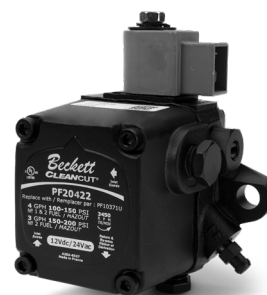
CleanCut Two-Stage PF20422