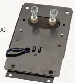
5272002U - Beckett SDC