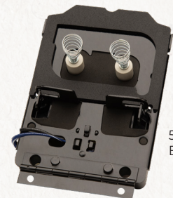
5272001U - Beckett ADC