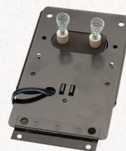
5250002U - Beckett SF/SM, CF500, CF800