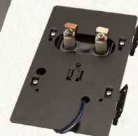
5250004U - Wayne EH/ EHASR