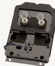
5250001U - Beckett AF/AFG