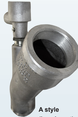
A style (less insert)